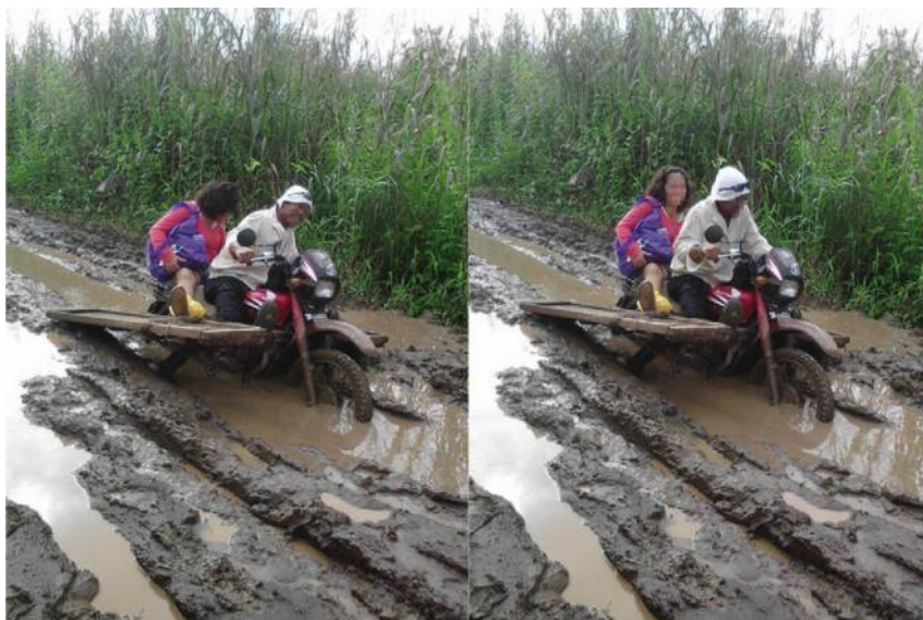
Fig. 2. Roads to School.

like teaching and learning ESL (Oladejo, 1991), teaching language and mathematics (Kyriakides & Creemers, 2009), teacher-child relationship building in pre-school education (Chung, 2000) and other practices. The term teacher factor has been used in popular discourse, especially in education communities. This term or an equivalent is often mentioned in TFG. Teachers express their sadness and exasperation that “teacher factor” is identified as the cause for a variety of problems, like the unruly behavior of students, poor reading skills, poor grades and failure, school dropout, and poverty. Teachers expressed weariness in the face of persistent blame. One teacher said they have to endure blame their entire lives – “teacher factor for life.” One meaning of the term’s use is to portray teachers as indifferent to school and social problems.